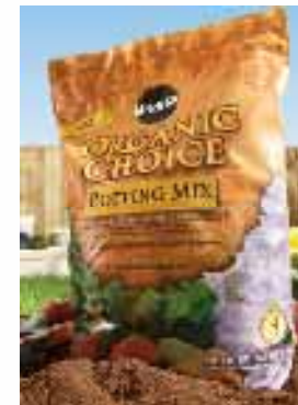
Organic Fertilizer Grows bigger, more beautiful plants organically – OMRI certified