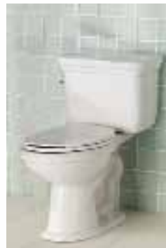
High Efficiency Toilets Uses up to 60% less Water without sacrificing performance