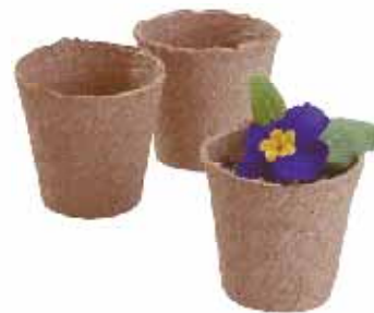
Biodegradable Peat Pots Pot disintegrates over time releasing nutrients into the soil