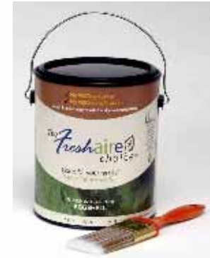
Zero VOC Paint No Chemical Odor and available in 65 colors