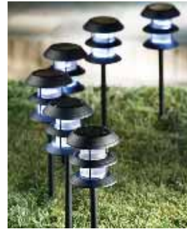
Solar Lighting Add style without electricity