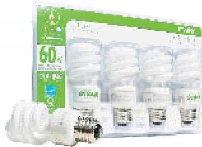
Compact Fluorescent Light bulbs (CFLs) Cut Energy Use by 75%